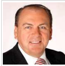
Axel A. Weber

Senior Fellow, Institute for New Economic Thinking; Former Chairman, Financial Services Authority; Member of the House of Lords, United Kingdom View Bio »