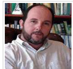
Arminio Fraga Neto Founding Partner, Gavea Investimentos; Former Governor, Banco Central do Brasil View Bio »