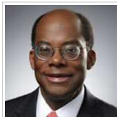
Roger W. Ferguson, Jr. President and CEO, TIAA-CREF; Former Chairman, Swiss Re America Holding Corporation View Bio »