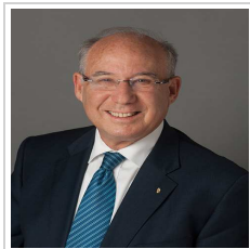
Jacob A. Frenkel Chairman of the Board of Trustees, Group of Thirty; Chairman, JPMorgan Chase International View Bio »