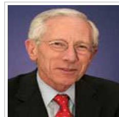
Stanley Fischer Former Governor, Bank of Israel; Former First Managing Director, International Monetary Fund View Bio »