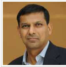
Raghuram G. Rajan

President and Chairman, Grupo Financiero Banorte; Former Governor, Banco de Mexico; Chairman of the Board, Bank for International Settlements View Bio »