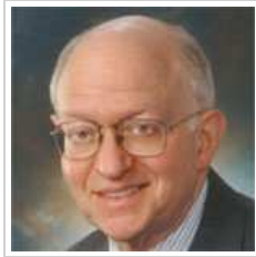
Martin Feldstein Professor of Economics, Harvard University; President Emeritus, National Bureau of Economic Research View Bio »