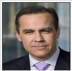
Mark J. Carney Governor, Bank of England; Former Governor, Bank of Canada; Chairman, Financial Stability Board; Board of Directors, BIS View Bio »