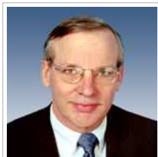
William C. Dudley President, Federal Reserve Bank of New York; Former Partner and Managing Director, Goldman Sachs View Bio »