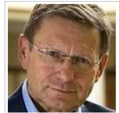
Leszek Balcerowicz Professor, Warsaw School of Economics; Former Governor of the National Bank of Poland; Former Deputy Prime Minister of Poland and Minister of Finance View Bio »