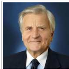
Jean-Claude Trichet Chairman, Group of Thirty; Former President, ECB; Honorary Governor, Banque de France View Bio »