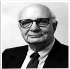
Paul A. Volcker Chairman Emeritus, Group of Thirty; Former Chairman, Federal Reserve System View Bio »

Current Members | Senior Members | Emeritus Members | Past Members