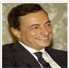
Mario Draghi President, European Central Bank; Former Governor, Banca d'Italia; Former Chairman, FSB View Bio »