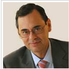
Jaime Caruana General Manager, Bank for International Settlements; Former Governor, Banco de Espana View Bio »