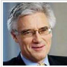
Lord Adair Turner

Charles W. Eliot University Professor at Harvard University; Former Director, National Economic Council; Former President, Harvard University; Former US Treasury Secretary View Bio »